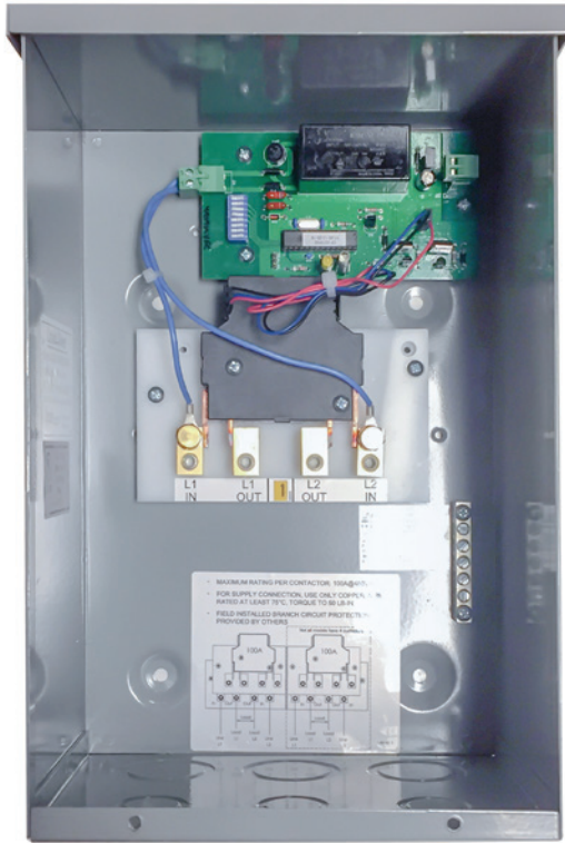
LS101X1BX-W2 100 Amp Latching Relay