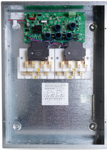
LS10114CX (4) 100 Amp Circuit (LS10112CX Not Pictured)