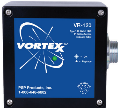
Surge Protector Device