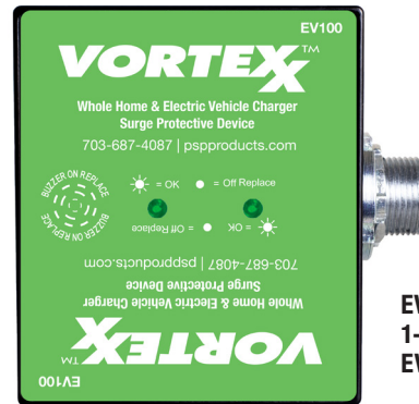
EV100 1-Phase EV Charger SPD