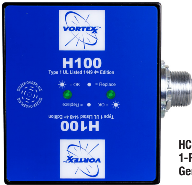
HC1C100-06N 1-Phase General Purpose SPD