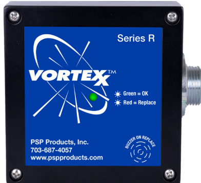
Surge Protector Device