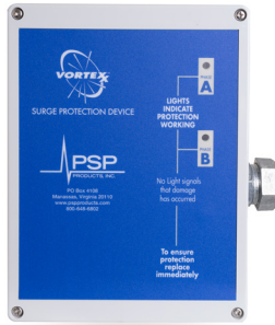
Nipple Mount Version