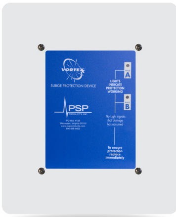
Flush Mount Version