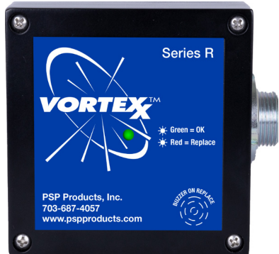
Surge Protector Device